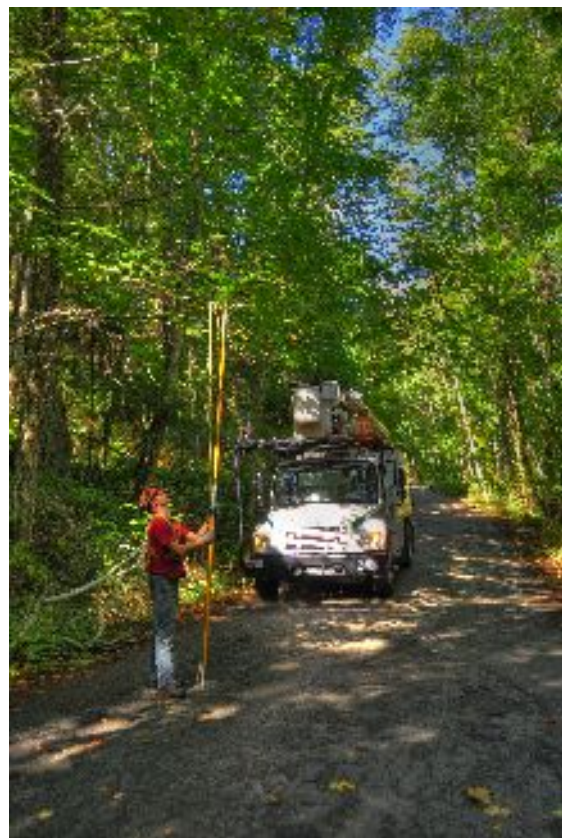
Saanich Parks crew measuring clearance before trimming low branches

During September Saanich Parks cleared overhanging tree branches along Churchill Drive in Mount Douglas Park as well as roads in Gordon Head and Cadboro Bay. This was initiated by the Saanich Fire Department's new truck that is now stationed near the University of Victoria. The trimming was done to the prescribed legal passage height of 14.5 feet. The Parks crews used a measured stick to determine what needed trimming as they worked their way along Churchill Drive and only cut branches hanging below the legal height that might catch on the fire truck, possibly dislodging a ladder or other equipment.