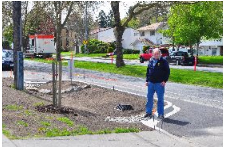
Bob Bridgeman at one of the new rain-water swales along Shelbourne Street. The swale acts as a small holding pond reducing storm drain surges and improving the water table for summer flows to Douglas Creek. Note that the drain is raised to handle pond overflow. Native plantings in the swales will reduce water-borne pollutants and make an attractive boulevard.

Hopefully Saanich will provide information sheets on the design and function of these swales along with planting and care guides. The swales need native plants appropriate for the function that are attractive, suitable and can withstand both dry and wet conditions.