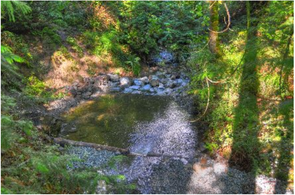
New salmon spawning pool, viewable from the new interpretive sign viewing area. The log slows storm surges and the rocks form a riffle for fish passage.