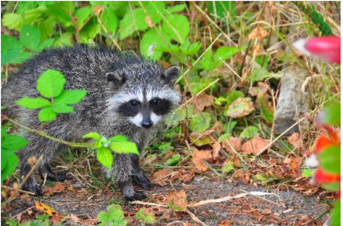
Another friend of Mount Douglas Park

Please remind friends and neighbours to take their yard waste to their local municipal yard for proper treatment and that dumping anything in our parks is not only illegal, it's an additional and unnecessary cost to tax payers and seriously endangers the health of our parks.