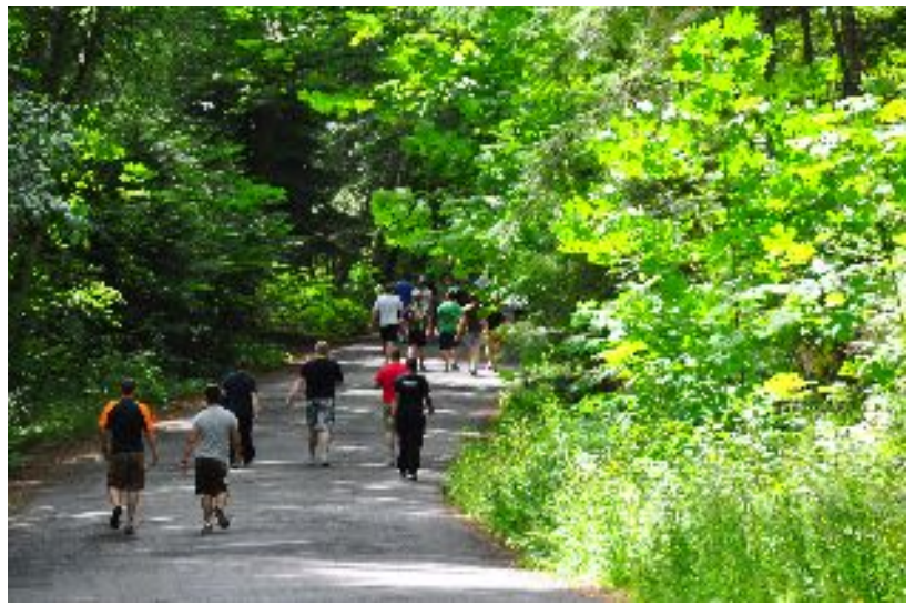
Mornings along Churchill Drive

Many have noticed the very significant increase in walkers, young and old, families with baby strollers walking up Churchill Drive in the morning enjoying the no-cars, no-exhaust, no-noise until noon. Perhaps one of the most telling comments often heard is “we have to get back down before the gate opens!” The idea of the new hours was to