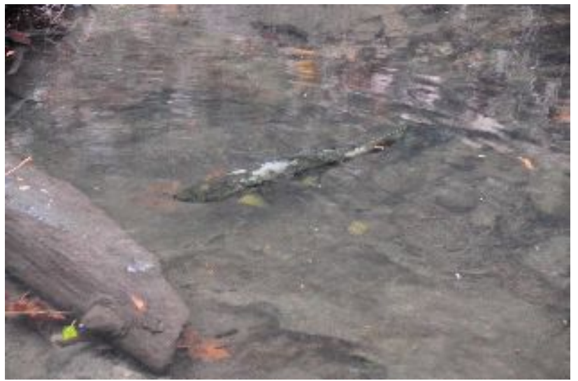
A large female Chum Salmon near Ash Road!

Hold the presses! Just as the newsletter was to be printed, salmon were spotted in Douglas Creek. A large female Chum salmon was spotted in one of the restored spawning pools near Ash Road. This means she successfully