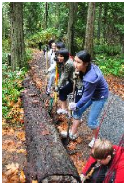
A volunteer line up!

almost 2000 trees and native plants grown by Rob Hagel at Pacific Forestry Research Centre from seeds harvested in Mount Douglas Park. Planters were in two locations, in the area of the Irvine Trail and Churchill Drive and along Douglas Creek near the new Salmon Life Cycle interpretive sign. We spotted several Councillors helping with the planting - Judy